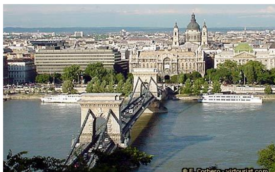
Chain Bridge and the Pest side of the Danube