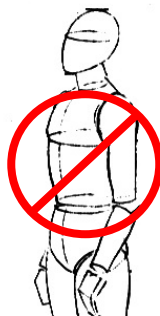
Head and body 45°